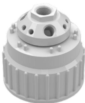
10-Port Manifold Nalgene® carboy/83B cap

Instrument specific fittings kits make connections at the manifolds easier and reasonably straight forward.