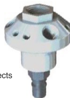
10-Port Manifold Justrite can with PP quick disconnects