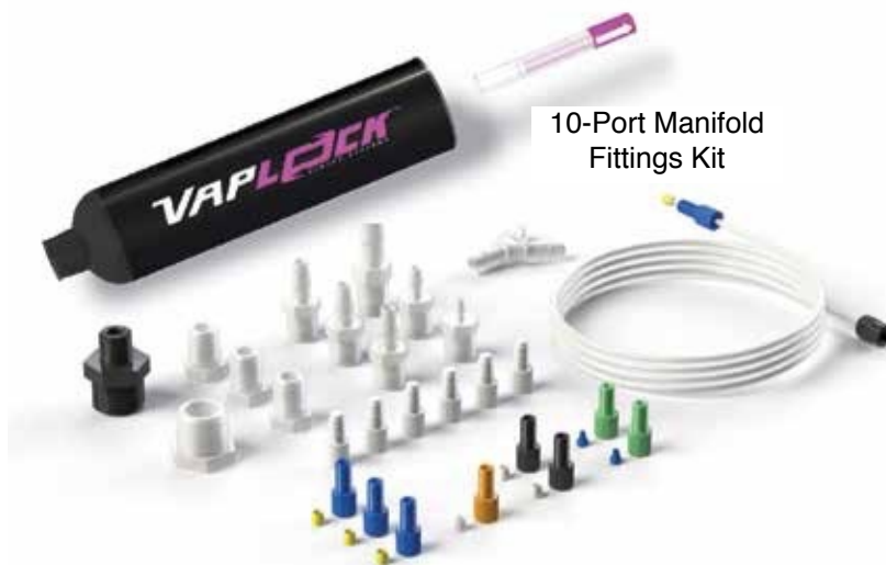
10-Port Manifold Fittings Kit